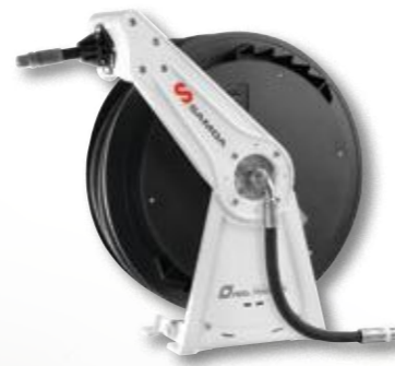
506222 Single Pedestal Oil Hose Reel