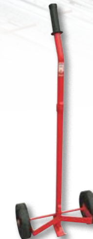
80096 Heavy Duty Drum Trolley $77.60