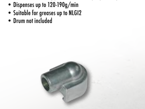
14506 $56.80 Pull on Button Head Grease Gun Coupler