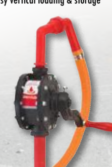
401A Ryton Rotary Drum Pump $293.10