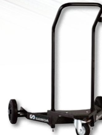
432000 205L Drum Trolley $644.10