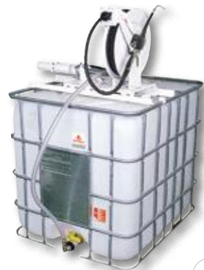
454695 IBC Oil Storage and Transfer Kit - Top Mount $3,880.00