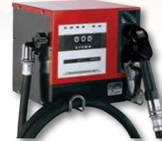
50070 $1,979.00 240V Diesel Fuel Dispenser