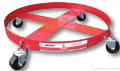
80100 205L Drum Dolly $124.10