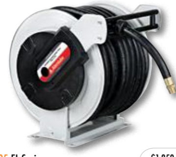
HR90005 EL Series $1,859.00 Spring Rewind Fuel Hose Reel