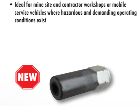
14514 $11.60 3 Jaw Hydraulic Grease Gun Coupler