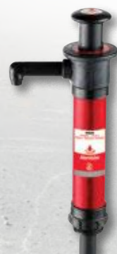
925 Polypropylene Drum Pump $137.80