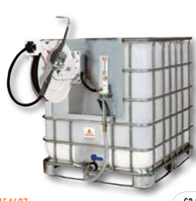
454697 IBC Oil Storage and Transfer Kit - Side Mount $3,820.00