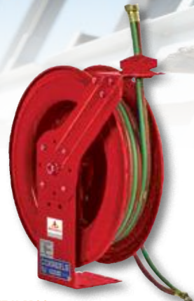
SHWT-N-1100 $3,170.00 Single Pedestal Oxy-Acetylene Hose Reel