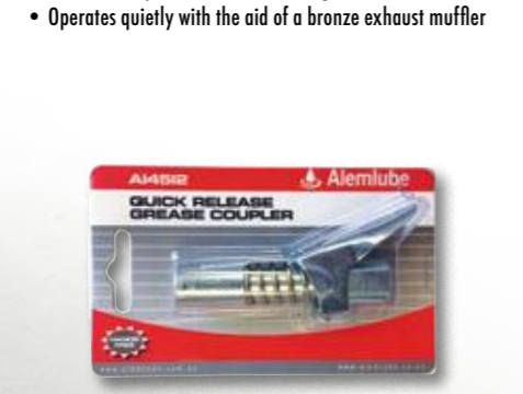
A14512 $36.20 Quick Release Grease Gun Coupler