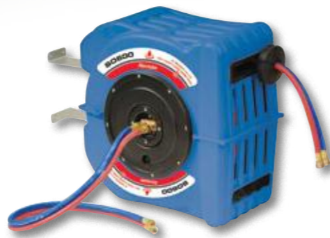
SO600 $487.00 Oxy-Acetylene Hose Reel