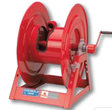
1185-1124 Hand Rewind Bare Hose Reel $2,650.00