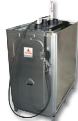
656110 1,000L Self Bunded Oil Storage & Dispensing Kit $4,620.00