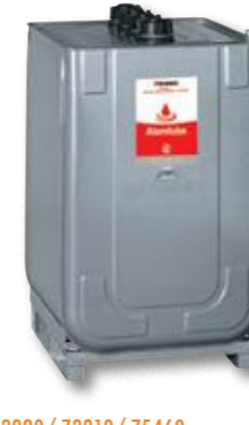
75490/ 73920/ 73910/ 75460 Self Bunded Twin Skinned Tanks