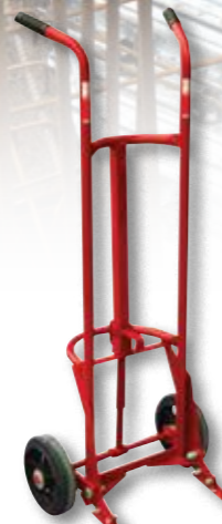
80180 180kg / 205L Duty Drum Trolley $542.00