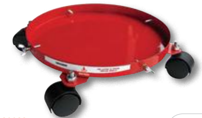
80082 20L/20kg Standard Duty Drum Dolly $80.10