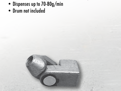
14507 $84.40 Push on Button Head Coupler with Built in Swivel