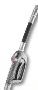
363054 3/4" High Volume Oil Control Valve $412.00