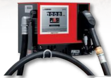
50090 High Flow $2,170.00 240V Diesel Fuel Dispenser