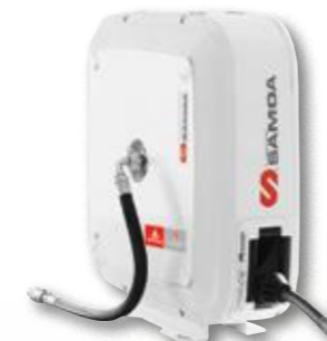
507222 Covered Oil Hose Reel