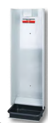
030020 EL Series Waste Oil Drip Tray $139.20