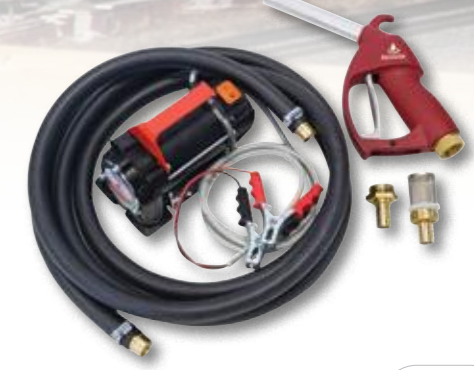
52000 $446.00 12V Diesel Refuelling Tank Kit