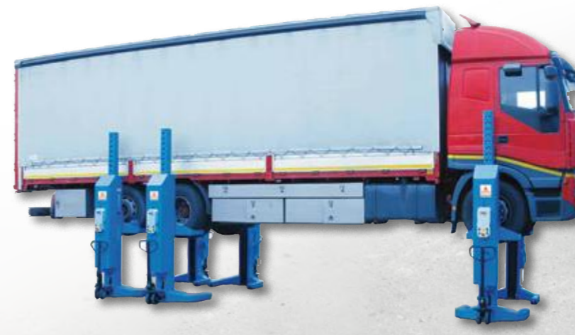
RAV307H.4WS Ravaglioli Set of 4 x 7,500kg S53,940.00