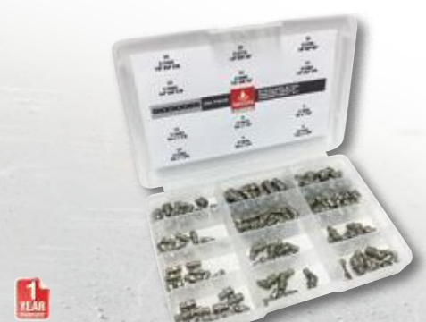
1 YEAR WARRANTY G100100SS EL Series $427.00 Stainless Steel Grease Nipple Assortment Kit