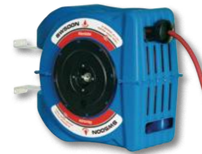
SW500N Water Hose Reel