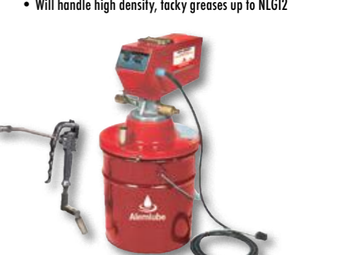
KPL-24EX $5,750.00 24V 20kg Grease Kit