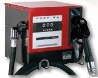
50056 $1,789.00 240V Diesel Fuel Dispenser