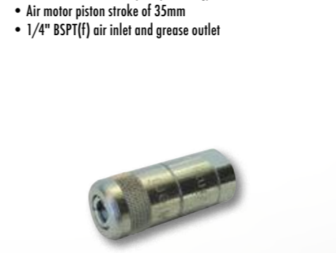
14513 $11.40 4 Jaw Hydraulic Grease Gun Coupler