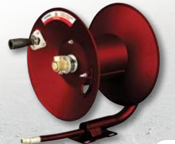
H10120 Hand Rewind Bare Hose Reel