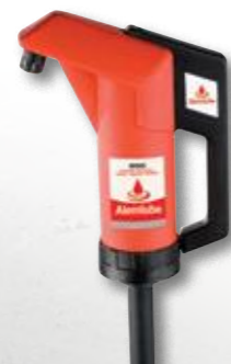
950 Lever Action Poly Drum Pump $126.00