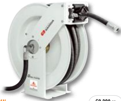
505224N $2,320.00 Spring Rewind Hose Reel