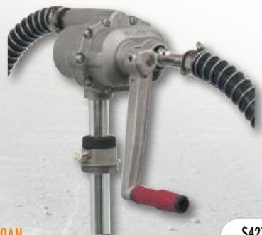
5060AN $421.00 Hi-Flo Refuelling Drum Pump