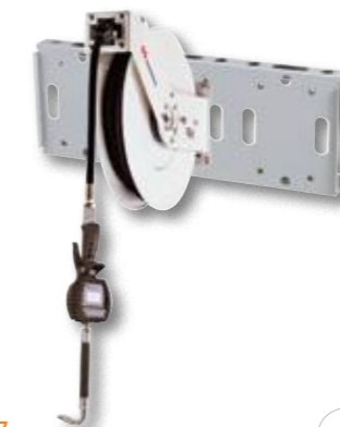
360117 Hose Reel Mounting Bracket $445.00