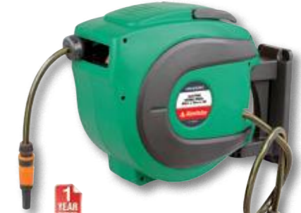
HR40050 EL Series Water Hose Reel