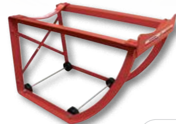
80205 205L Drum Rack $176.80