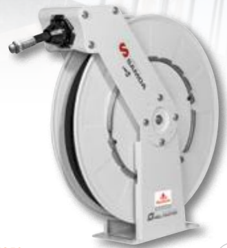
504250 Twin Pedestal Oil Hose Reel $1,489.00