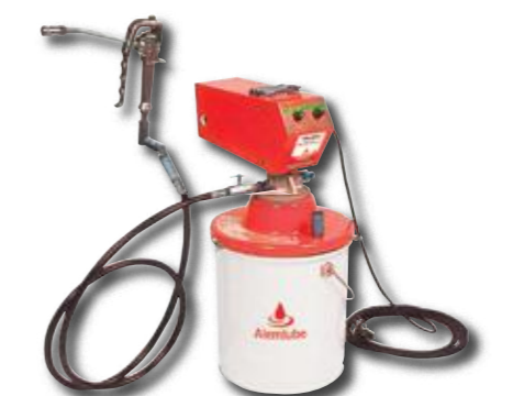
EPL-240SP $5,980.00 240V 20kg Grease Kit