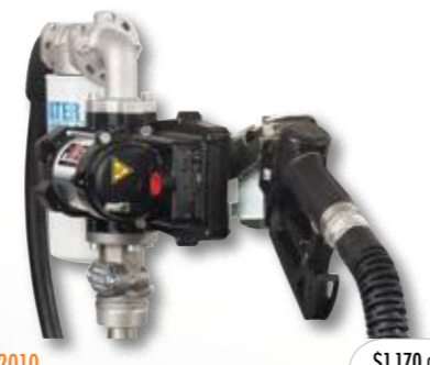
372010 $1,170.00 12V Petrol & Avgas Drum Pump