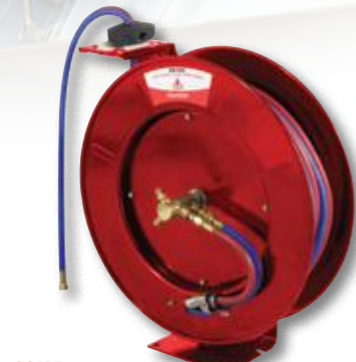
OS615 $530.00 Single Pedestal Oxy-Acetylene Hose Reel