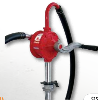
501A $150.20 Rotary Action Drum Pump