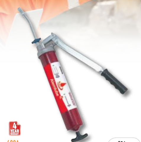
4 YEAR WARRANTY 600A $86.10 Lever Action Grease Gun