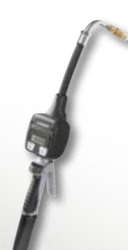
365534 Electronic Oil Meter $929.00