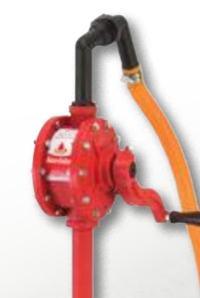
301A Polypropylene Rotary Drum Pump $206.40