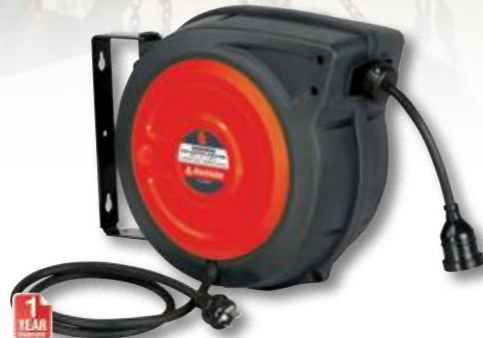
CR30050 EL Series S324.00

BRP5216 Safety Barrier Reel as above but with red/white band S350.00