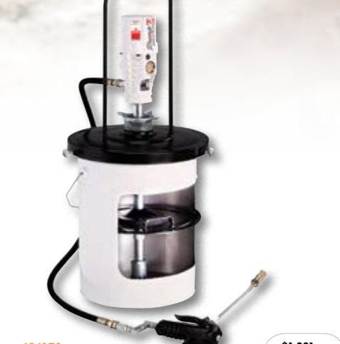
424170 $1,221.00 20kg Grease Kit