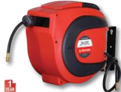
HR40030 EL Series Air Hose Reel