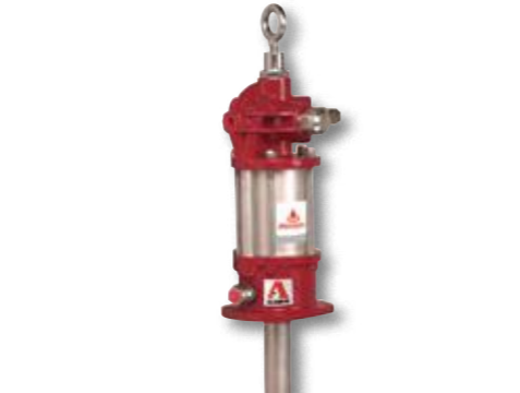
7785-A5 $7,430.00 Alemite High Volume 180kg Grease Pump