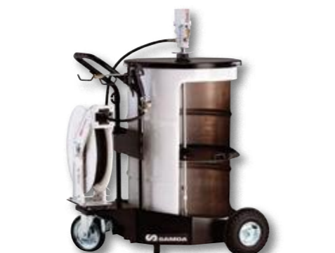
428200 $4,780.00 180kg Mobile Grease Kit