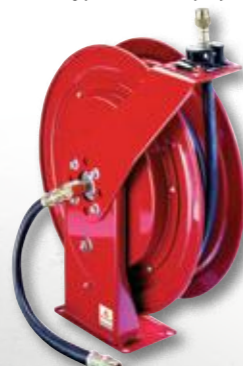
8078-D Alemite Heavy Duty Single Pedestal Hose Reel

H10120 Also available supplied with 40m x 19mm ID hose capacity $224.70