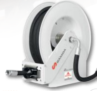
508225 High Volume Oil Hose Reel $2,820.00