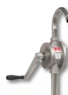
801A Stainless Steel Rotary Drum Pump $556.00