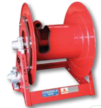
1195-932-A Large Capacity Air Rewind Bare Oil Hose Reel $6,500.00