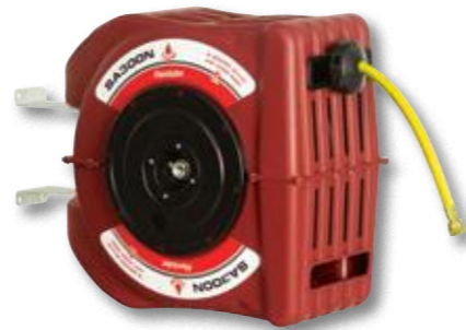
SA300N Air Hose Reel