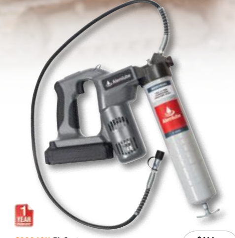
1 YEAR WARRANTY G10040N EL Series $464.00 18V Lithium-ion Cordless Grease Gun