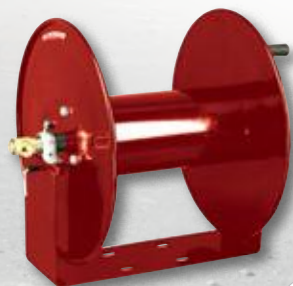
H10300 Hand Rewind Bare Hose Reel