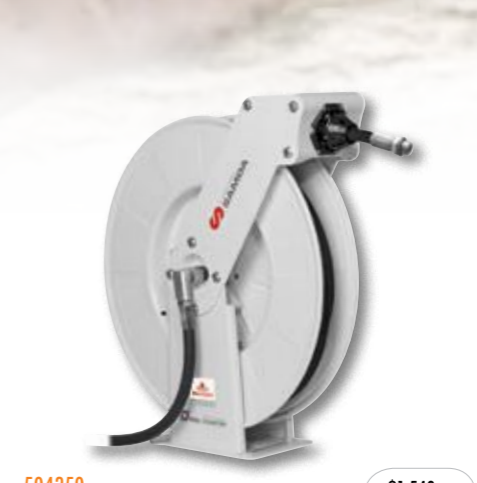
504350 $1,540.00 Twin Pedestal Grease Hose Reel