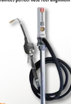
454110N Oil Transfer Kit with Meter $1,617.00