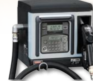
51090 $4,300.00 240V Smart Fuel Dispenser