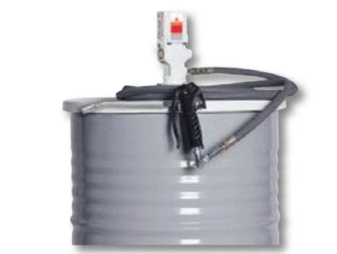
428262 $1,883.00 180kg Air Operated Grease Kit