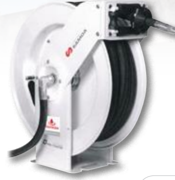
505232 Spring Rewind Hose Reel $2,210.00