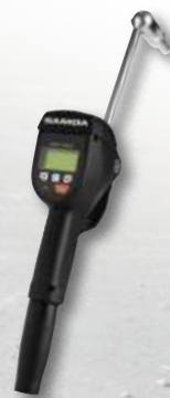
365300 Electronic Preset Oil Meter $1,187.00