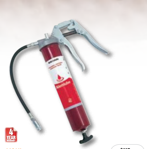
4 YEAR WARRANTY 660AN $117.40 Trigger Action Grease Gun