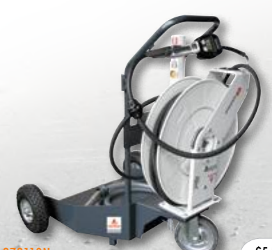
378110N 205L Mobile Oil Transfer Kit $5,550.00