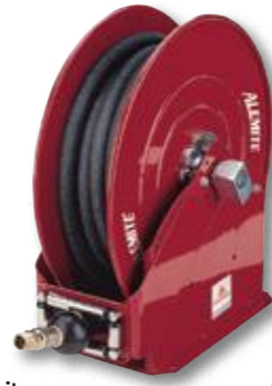
8080-G Alemite $3,200.00 Large Capacity Fuel Hose Reel