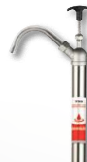
733 Stainless Steel Push Pull Action Drum Pump $395.00