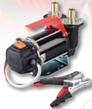
52040 $426.00 12V Self Priming Diesel Fuel Transfer Pump