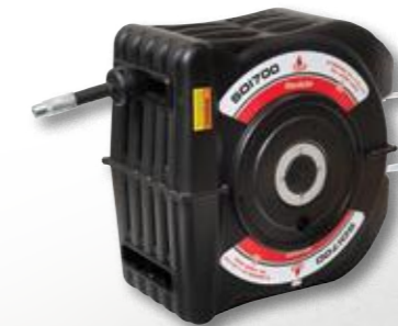
S01700 S Series Oil Hose Reel