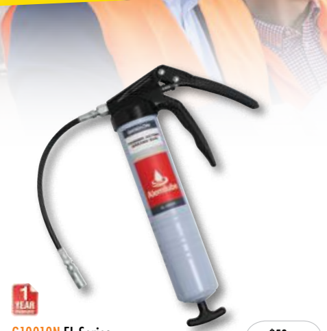
1 YEAR WARRANTY G10010N EL Series $59.10 Trigger Action Grease Gun