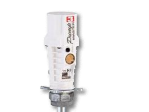
404100 $987.00 20kg Grease Pump