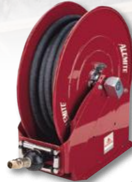
8080-F Alemite Heavy Duty Oil Hose Reel $3,420.00