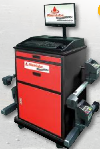
AAW8CCD Alemlube Automotive S14,660.00